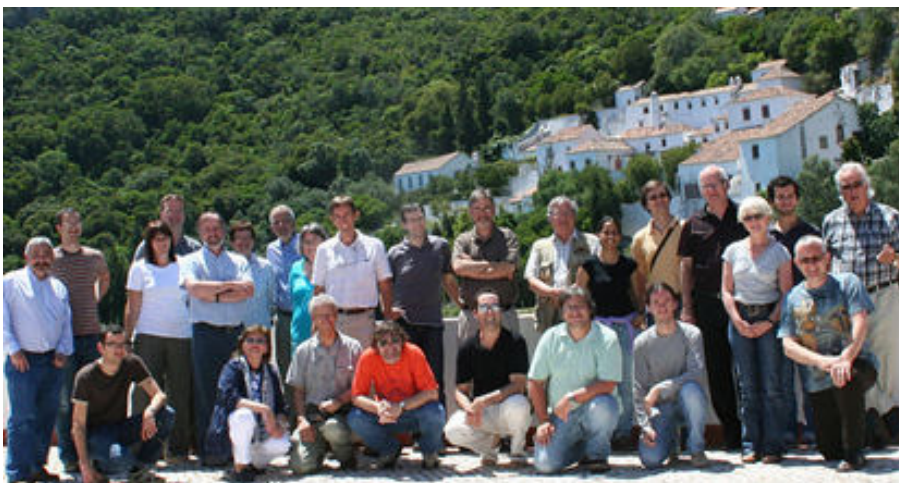
Members of the ProAm ConVento Group during the WR 140 campaign workshop 2009 in Portugal